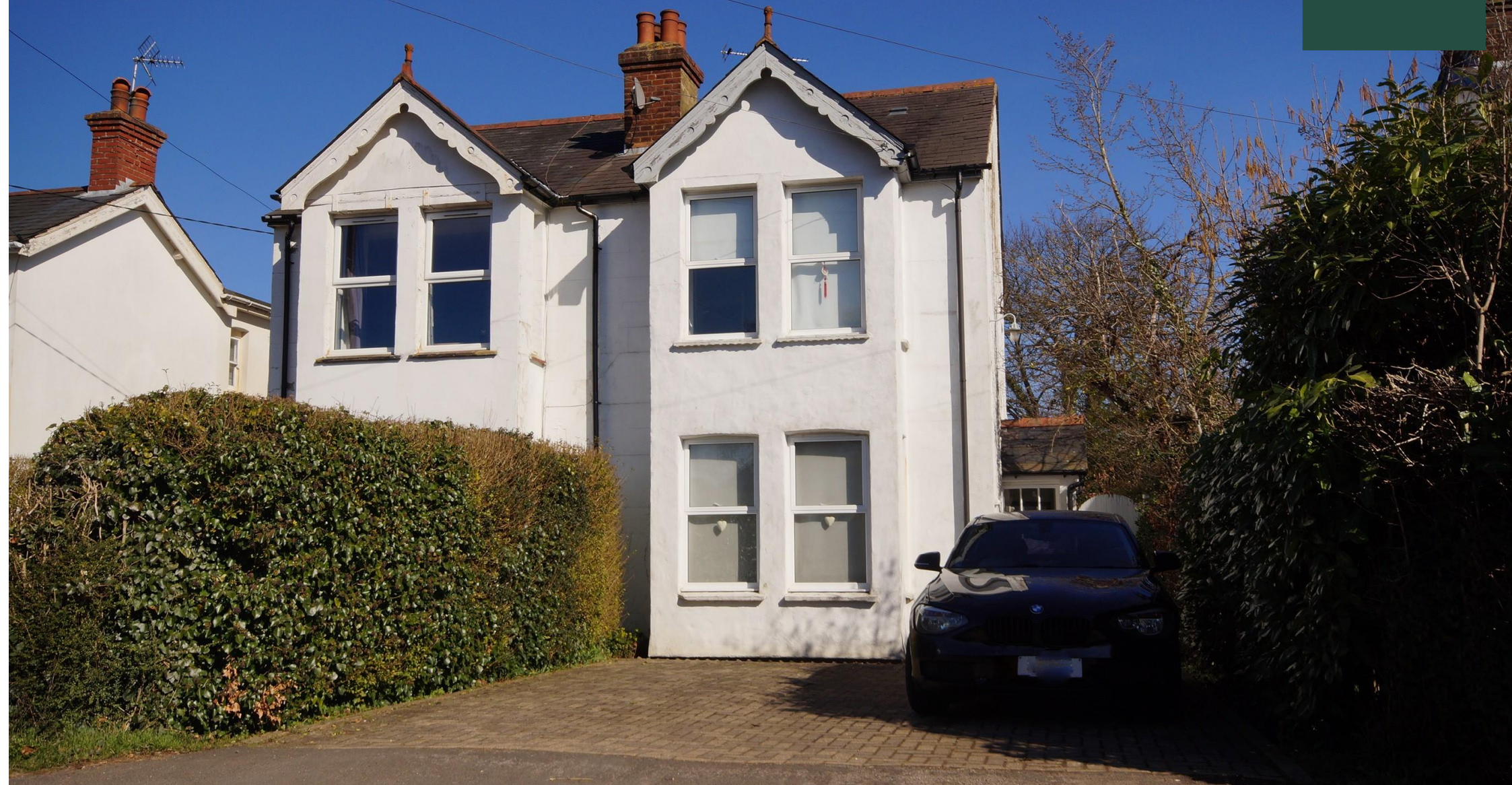
Hillcroft 81 Wycombe Road Prestwood Buckinghamshire HP16 0HW